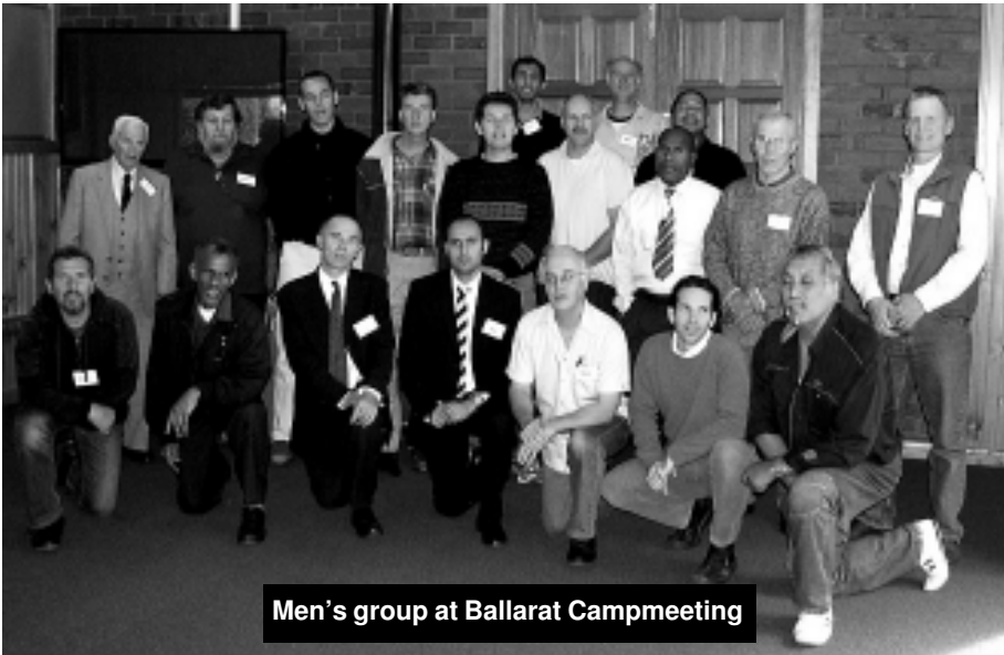
Men's group at Ballarat Campmeeting