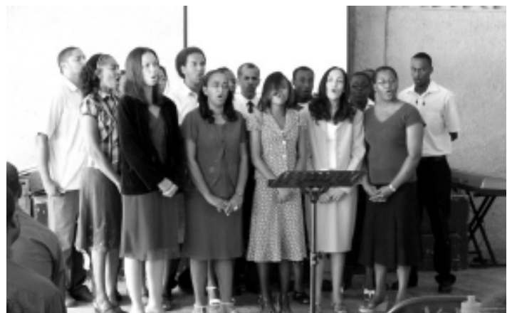
The Choir sings "This is the Time I must Sing"

(Rom 8:32) He that spared not his own Son, but delivered him up for us all, how shall he not with him also freely give us all