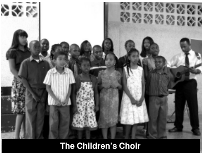
The Children's Choir

But what was the real element which made this campmeeting so special? It was the marked presence of Christ among us. From the beginning there was such a spirit of unity and love among the brethren that it was remark-