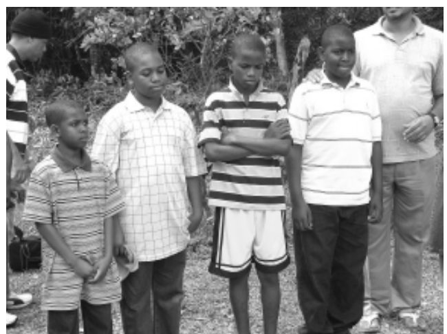
Four thoughtful newly baptized boys