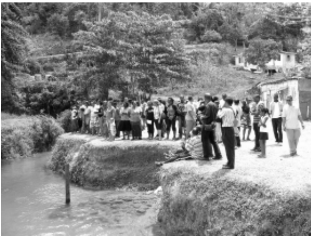
A large crowd gathers to view the baptism