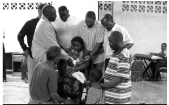
Prayer for the sick

Of course, not everyone was healed instantly. Some were not healed until some time afterwards and some are still waiting on a positive response to these prayers. If God is always the same and it is His desire to heal our diseases, then why is it that not everyone is healed, and why do some receive