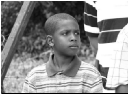
Taj-Wayne travelled from England