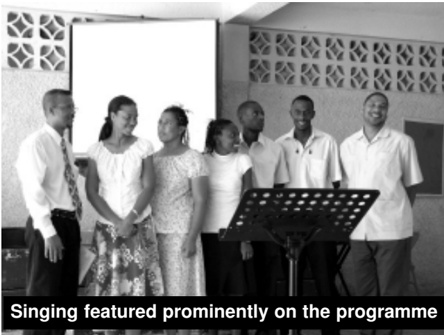
Singing featured prominently on the programme