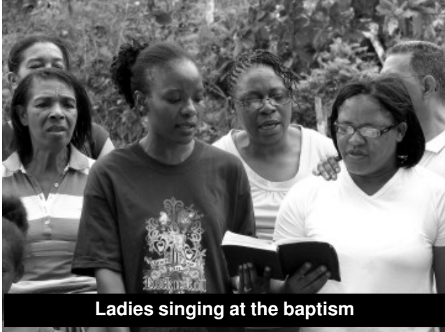
Ladies singing at the baptism

This year the Jamaican campmeeting returned to the hills of St. Ann, to the Mount Glory campsite located near Moneague. This campsite is nearly three hours away from where most of us live in Mandeville and is at least an hour away from the home of anyone who attended the campmeeting. Normally, we like to have the campmeeting closer to home so that it will be easier to make arrangements to prepare the