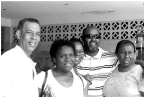
Meeting of friends - USA, England, Jamaica