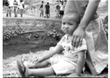
What's all the fuss about?