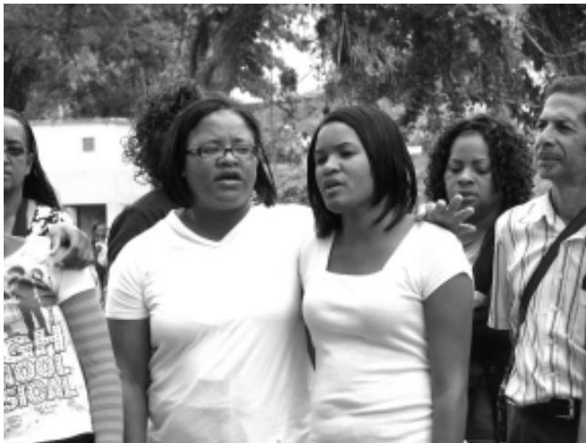
Songs of praise accompanied the baptism