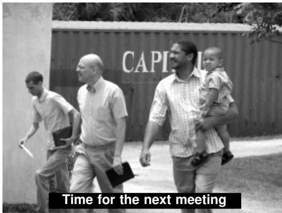
Time for the next meeting