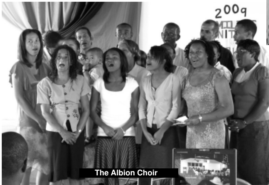
The Albion Choir