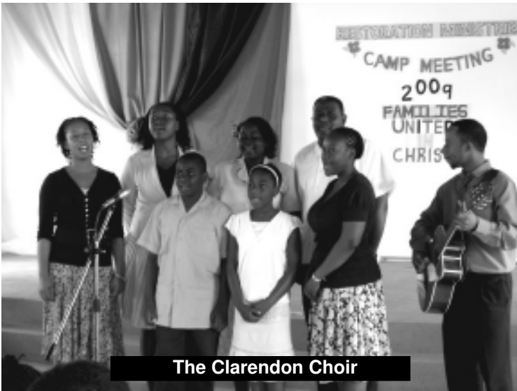
The Clarendon Choir

The messages generated tremendous interest. The organizers of the camp meeting this year endeavoured to bring a more practical atmosphere to the presentations by having more workshops and less sermonizing. Some greatly appreciated these seminar-type meetings and expressed satisfaction and felt that they had been very much helped by them. Others however, wanted more of an emphasis on spiritual truth and seemed to be disappointed with this change in the way of doing things.