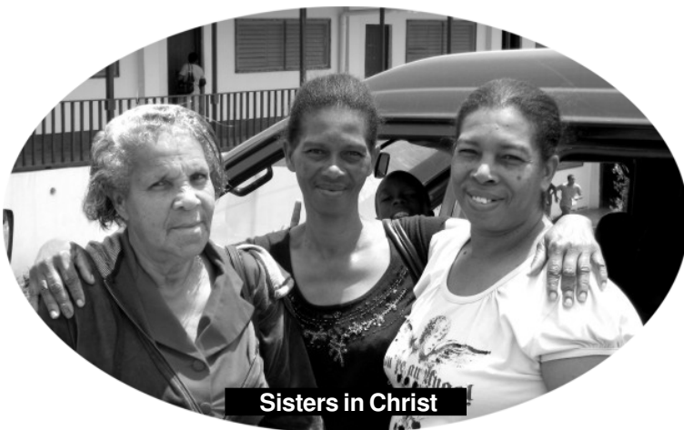
Sisters in Christ

For me, personally, it was very interesting to view the different modes of presentation. As I listened, I was challenged with the question as to which method of presentation drew the listeners closer to the Lord, and, for me, this question made me lean more strongly towards the preaching, rather than the seminar/workshop presentations. One danger which I noticed was that in the seminar-type presentations there was a tendency to concentrate more on human ways of solving problems and less of an emphasis on what God could do and would do. I suppose that when we, human beings speak of being “practical,” we tend to think of what we humans can, and must do. However, I saw the need to be careful to ensure that in everything which we say and do, we place Christ in the center of it, not just by a token use of His name, but by truly seeing Him as the one complete, all-sufficient answer to all our problems.