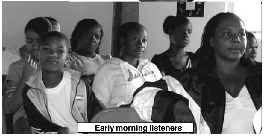
Early morning listeners