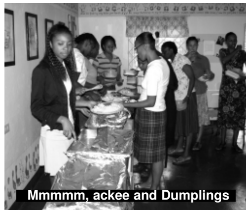
Mmmmm, ackee and Dumplings