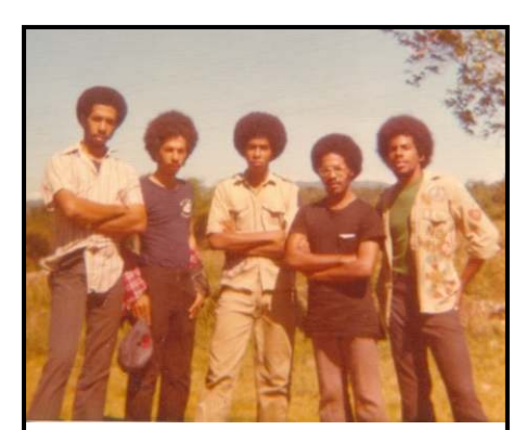
5 brothers before meeting Christ (I am on the right facing)

I was a part of a large family, my parents eventually had seven boys and three girls. My father was a Seventh-day Adventist minister at the time when I was born. Later on, when I was ten years old, he resigned from the ministry because of personal indiscretions and friction with the church administration.