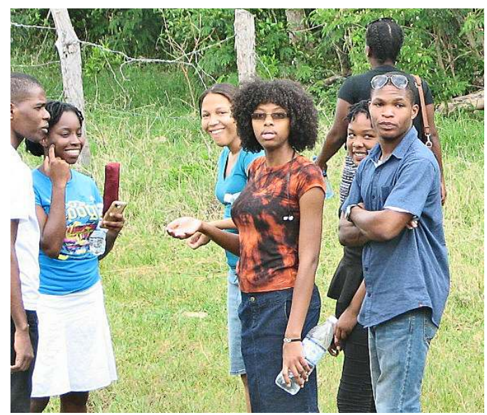
The youth found their own level