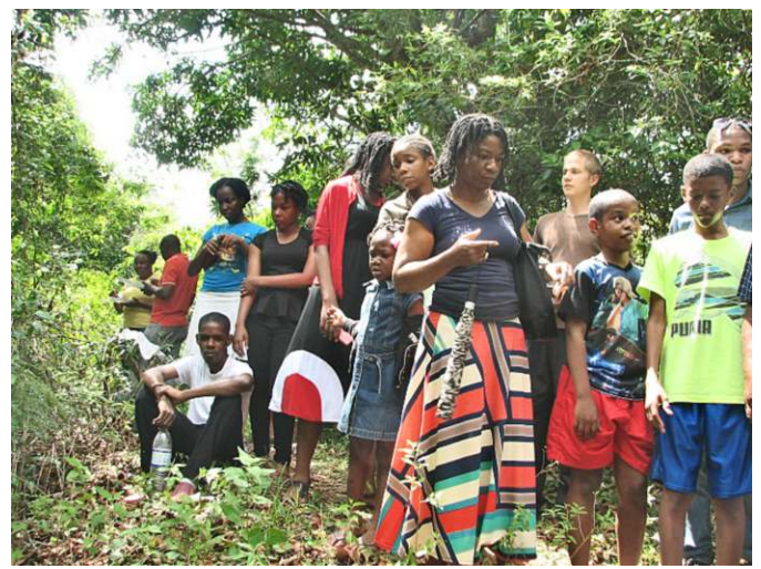
Gathering for the baptism