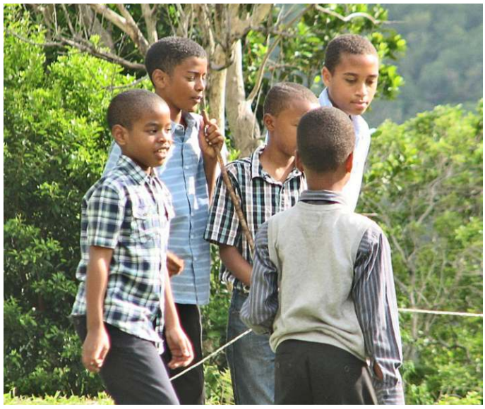
As always, the boys found time for a bit of fun