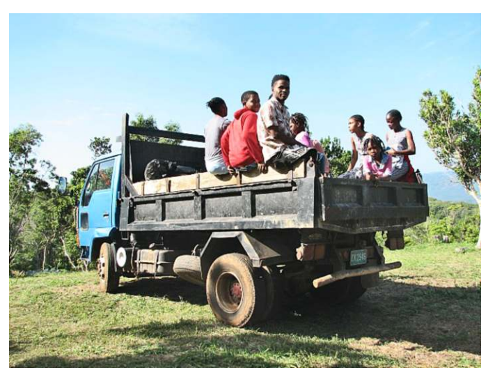
Transportation came in all sizes!