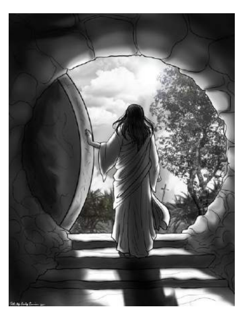
AN ETERNAL GIFT

His third begetting - as the new creation: He was humanity coming back from the dead into a new existence, reborn by the power of God as a brand new race with a different destiny. In this identity he is not unique, there will be others like him. When he became the son of God in the resurrection and was glorified and exalted to the pinnacle of glory, he opened the door for all who believe in him to experience the same privilege, but it is only possible because he first experienced it.