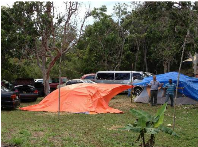
Setting up tents on the first day

The theme of the campmeeting was, "Grace, Faith and the End-time." Most of the presentations had some emphasis on the signs of the times and the reality that we are living in the very last moments of time. Of course, as has been the case for the past ten years, there was also a strong emphasis on the grace of God manifested in the gift