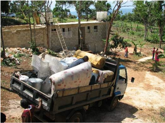
All packed up and ready to leave