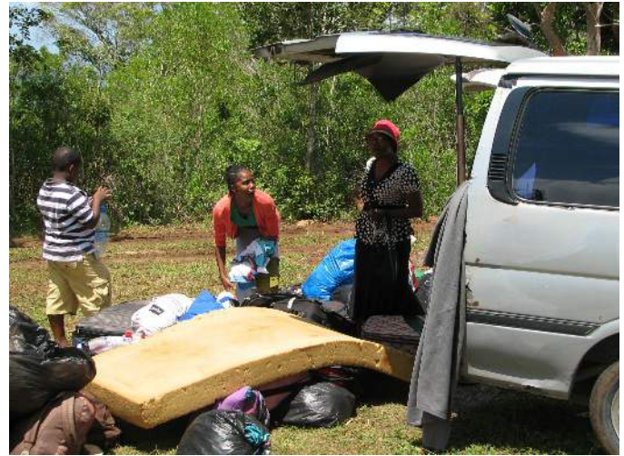
Trying to get it all back in