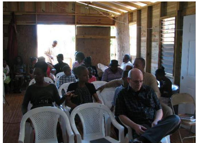
Getting ready for the Sabbath morning meeting