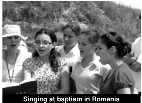
Singing at baptism in Romania