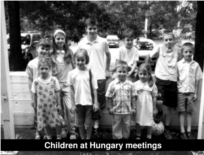
Children at Hungary meetings

it were similar. But I have never participated in a communion with one cup of wine passed around and everybody drinking from it, yet, as I thought about it, it must have been the way it happened in that first communion service at which our Lord Jesus officiated.