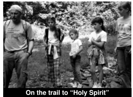
On the trail to "Holy Spirit"

During the evening meetings we had visitors every night right up to the final