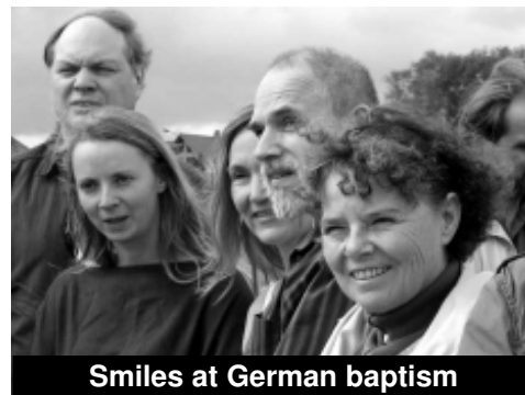
Smiles at German baptism

ing stories of this camp meeting was that of a couple who lived 500 kilometers away, but could not afford to come to the campmeeting. Their only option was to come by bicycle, so they decided to ride that distance just to be there. The husband is 69 years old and the wife is in her mid-fifties. The journey was very difficult as it took them