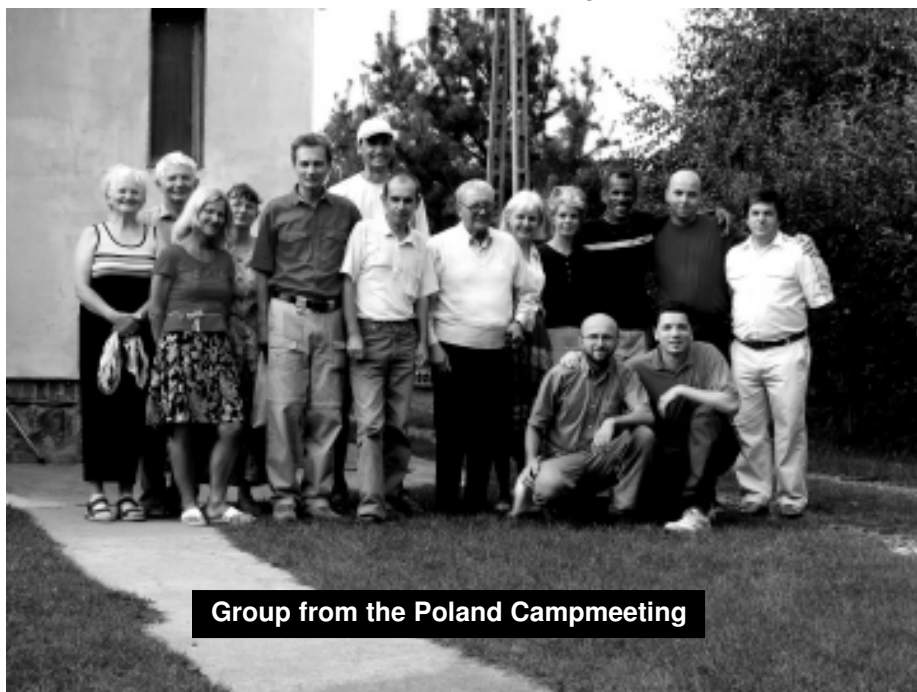
Group from the Poland Campmeeting

So on the third evening, I spoke about the relationship between the truth about God, and the doctrine of Righteousness in Christ. I made it clear that the holy spirit is the actual life of Christ and not a separate person from Christ, and that this truth is the very foundation of Righteousness, since, when we receive the