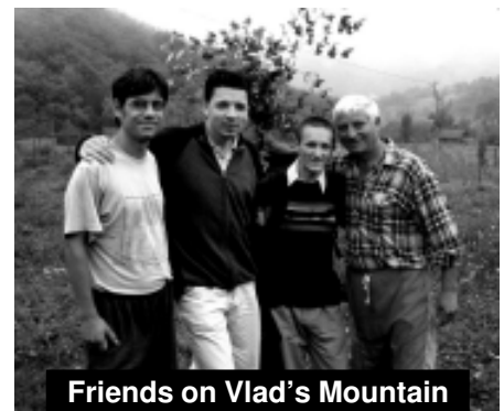
Friends on Vlad's Mountain

I grabbed my toothbrush and sleeping garments and we started off on a path which seemed to be climbing up the side of a mountain. After a while we