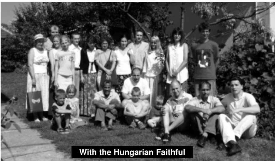
With the Hungarian Faithful

On the Sabbath evening after the final meeting, we met with a sister and her husband who are members of the KERAK Adventist church (the same